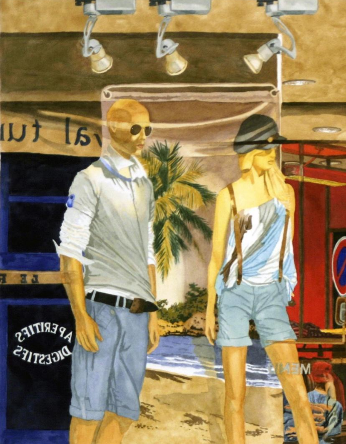
Aperitifs / Watercolor on fine art paper / 86 x 56 cm / 2010