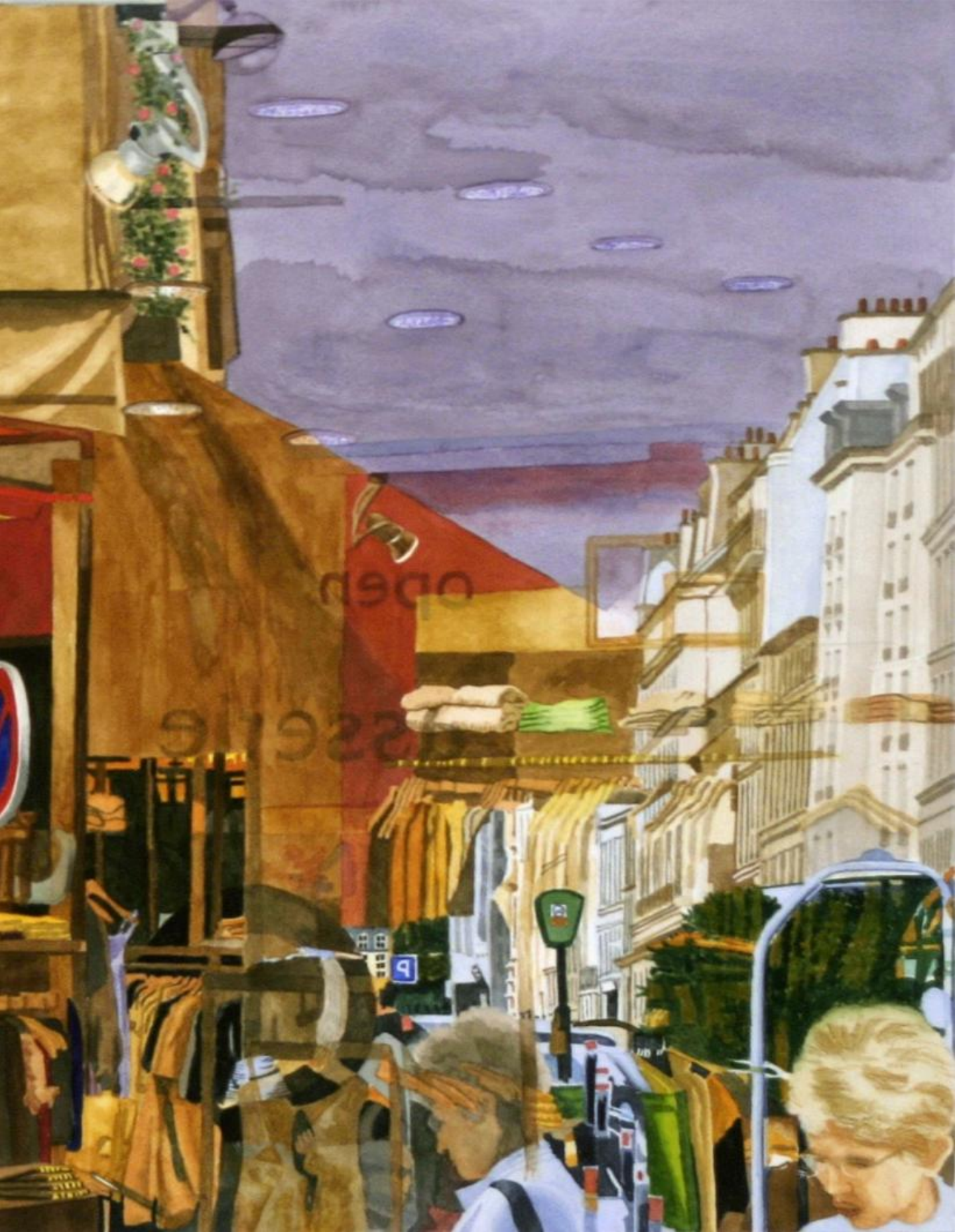
“On the right shoppers crowd racks of clothing on the street outside a store window with threatening skies. Inside the store are two manikins dressed in modern hip style placed in front of a photograph of a beach. The spot lights on the manikins give the colors inside the window a warm glow. The head of the woman shopper in the right front foreground is actually outside the plane of the window and her back side is reflected in the window to the viewer's left.” Richard Ewen